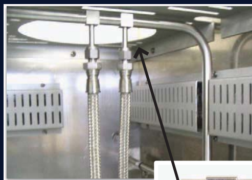
Orbital Welded Manifold with Flexible Tubing