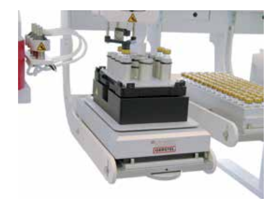
<sup>m</sup>VORX: Simultaneous vortexing of up to 8 samples on the MPS

The MAESTRO PrepAhead functionality ensures Just-In-Time sample preparation followed directly by sample introduction to the LC/MS or GC/MS for best possible productivity and throughput.