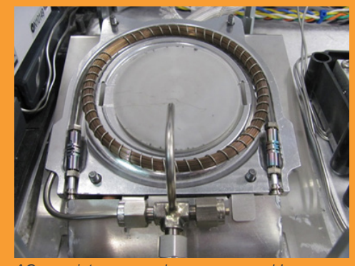
AC proprietary secondary programmable column oven