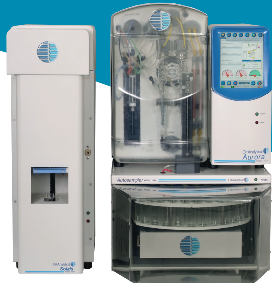
1030S Solids Module

The sample cup with TIC-free sample is placed on the lift mechanism and raised into the combustion tube of the 1030S (1). The sample is heated to 500^\circ - 900^\circ \text{C} inside the furnace. Organic matter in the sample is oxidized and converted to \text{CO}_2 which is collected in a one liter capacity gas sampling bag (2). When the combustion cycle is complete an aliquot of the \text{CO}_2 sample gas is transferred to the NDIR detector in the Aurora 1030 analyzer for measurement of the mass of carbon in the sample (3).