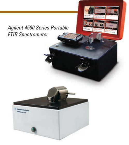
Agilent 5500 Series FTIR Spectrometers