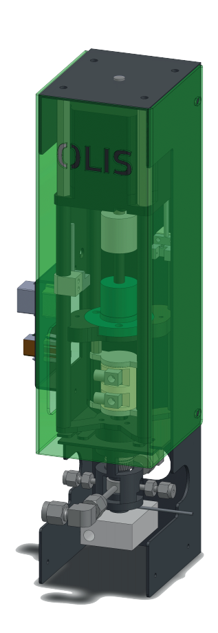
3D-view of the OLIS valve

CMR compounds analysis in the lab without sample handling.