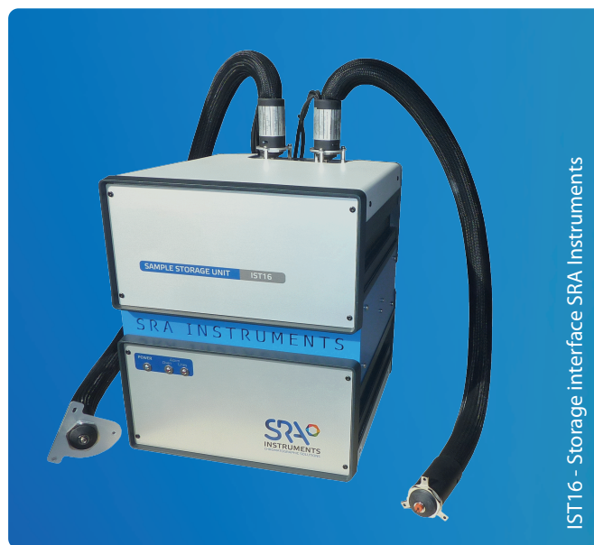
IST16 - Storage interface SRA Instruments

The IST16 is supplied with a dedicated interface. It is possible to edit the storage sequence, save the methods, view the status of the instrument and automatically manage the start of the GC analyses.