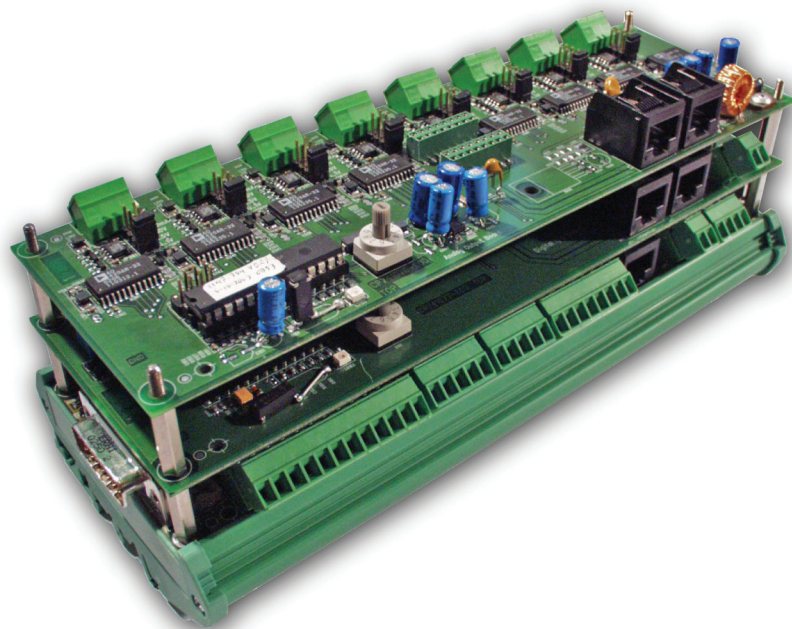
Figure 3. Stackable extension boards - basic, analog, and digital