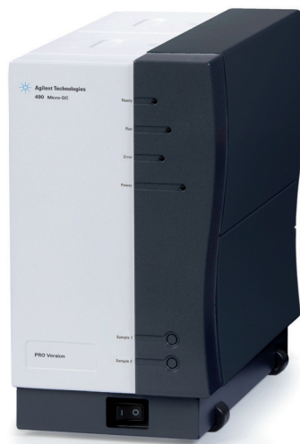
Figure 1. Agilent 490 Micro GC

Better measurement means greater knowledge. That is what the Agilent 490-PRO Micro GC gives you to ensure faster, more repeatable monitoring and control of your processes. The 490-PRO Micro GC can be used for many industrial applications, from refinery gas composition, to component trace detection, down to parts per million levels. With up to four independent channels, the flexible design of the 490 Micro GC covers a broad range of gas analysis tasks, including the determination of complex samples.